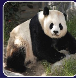
San Diego Zoo