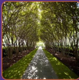
Arboretum and Botanical Gardens