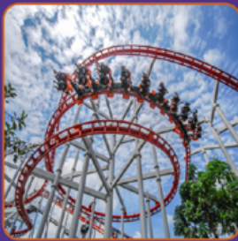
Six Flags Over Texas