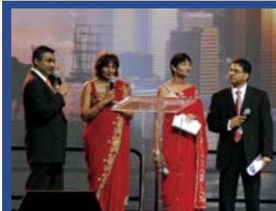
Masters of Ceremonies